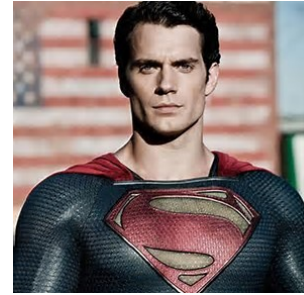
VACANT Program Operations