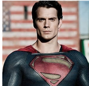
PENDING Professional Dev Days